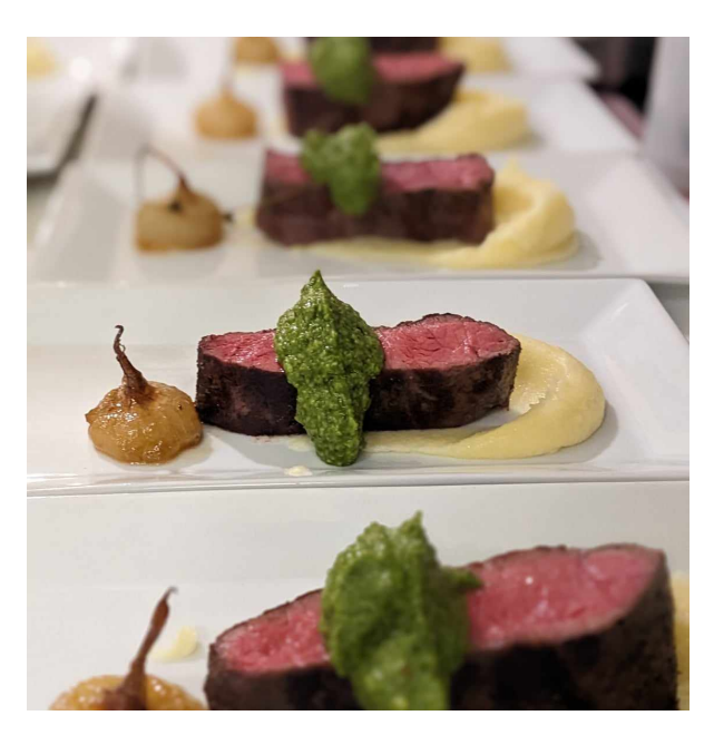
TAKE HOME CATERING Tanuary-March